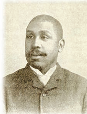
AUCC W.P. Hall

In contrast to the federal markers for USCT who were low on the economic ladder and sometimes illiterate, a headstone in Pennsylvania's album is a clear example how the economic status of a veteran is reflected in a monument.