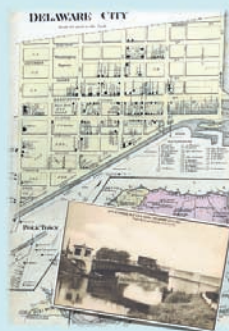
Area of the State of Delaware from actual surveys by and under the direction of D.G. Barr 1868

The African American community known today as Polktown is one of the earliest remaining free black settlements in Delaware and has been continuously occupied for nearly two centuries. It extended on both sides of the historic branch canal and included a church, school and residences.