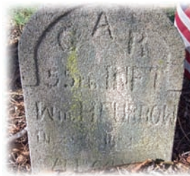
AUCC Furrow Mt Olive

This federal stone, from Wilmington, had dates added.