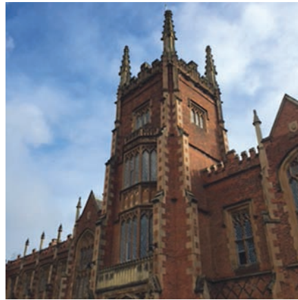
Queen's University, Belfast