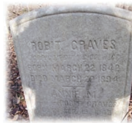
AUCC Graves Mt Olive

This stone looks homemade. So does one other.