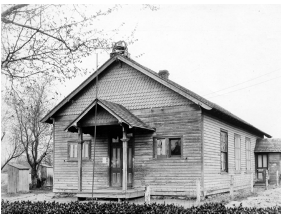
Figure 3: Polktown School, circa 1921

Weeks, Stephen B., History of Public School Education in Delaware, Department of the Interior, Bureau of Education, Bulletin 19, Washington, Government Printing Office, 1917