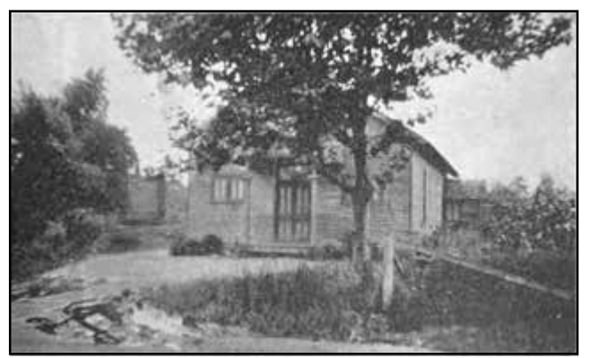
TE--Marsh to the left with Canal boat back of in Figure 4 The old school in Polktown. (Strayer)