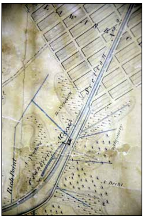
Figure 1 Circa 1829 Map of early C & D Canal (now the Branch Canal) showing Cranberry Marsh.

Delaware City got its start in 1801 when John Newbold purchased a tract of land that became known as Newbold's Landing. What really put this area on the map was the completion of the Chesapeake & Delaware canal in 1829. This was not the huge canal with big bridges that we see today, but a 60-foot-wide waterway (Figure 2) that split Cranberry Marsh in two.