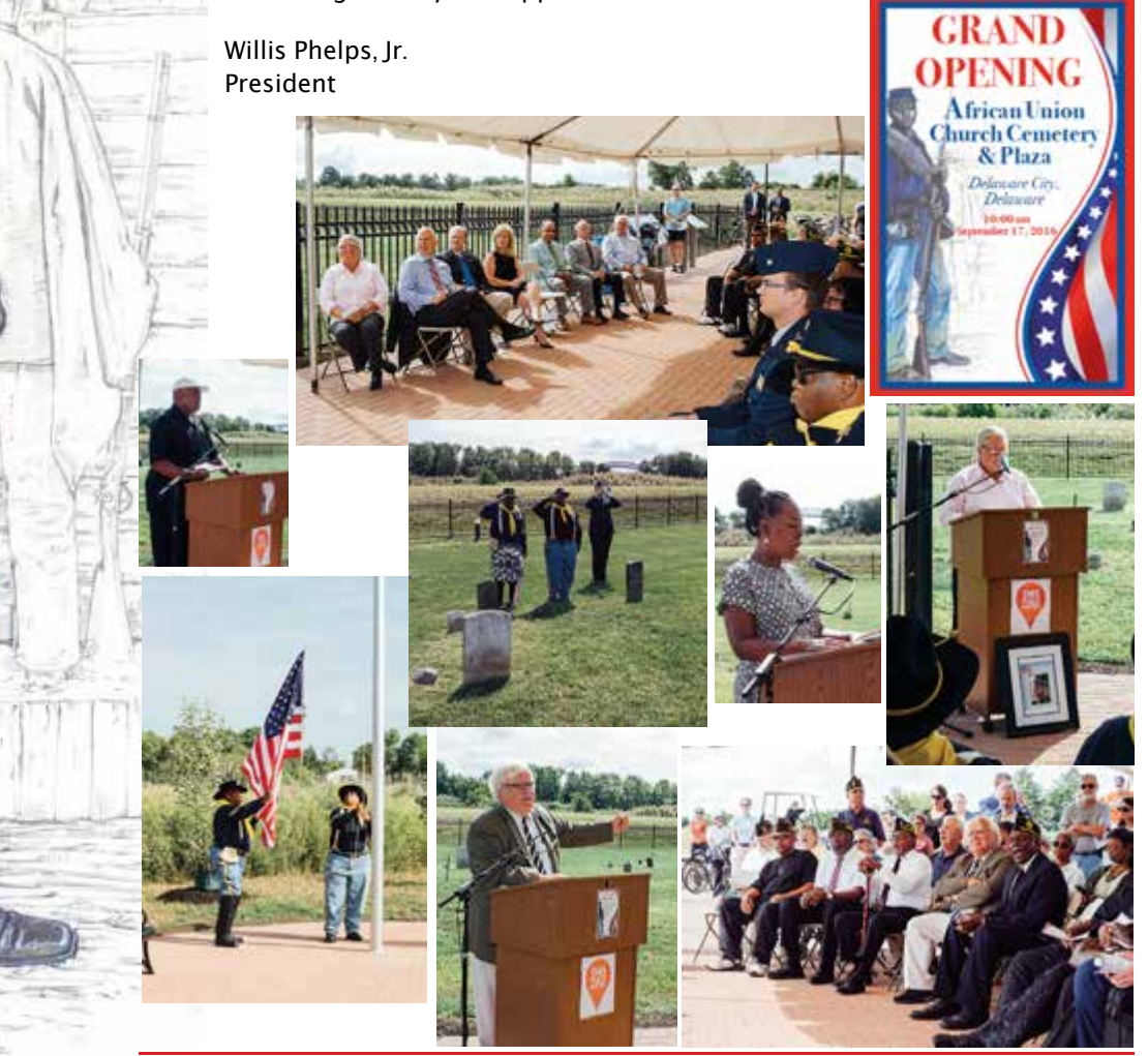
The Friends of the African Union Church Cemetery is a 501 (c)(3) organization. Contributions are tax deductible.

May this coming year be a blessed one for each and everyone. Thanks again for your support.