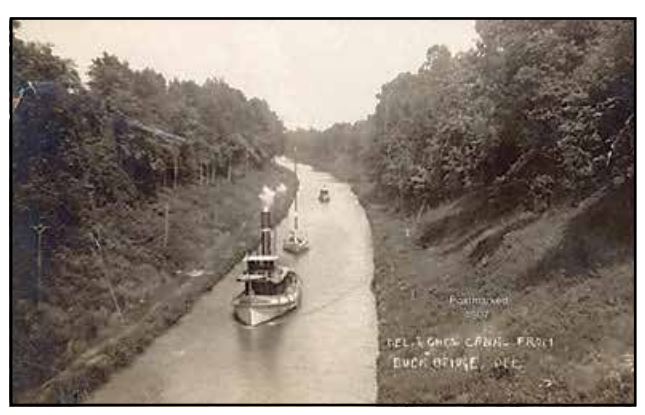
Figure 2 The C & D Canal in 1907 (Cecil)

Today, while older residents remember a thriving community, just a handful of houses remain in this area, and several are unoccupied.